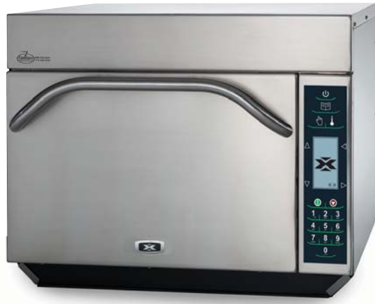
Model MXP5221 shown