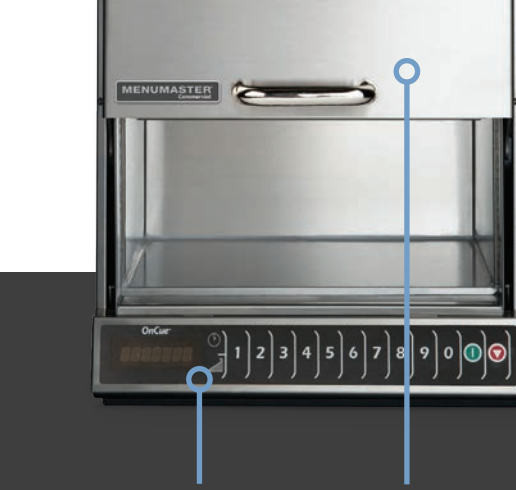
Unique pop up door