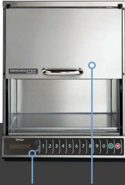
Angled control panel is easy to view and operate