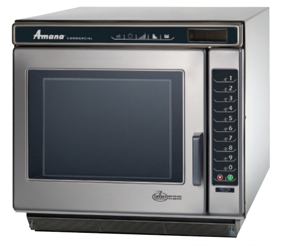
Model RC17S2 shown