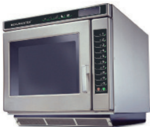
Model MRC17S2 shown