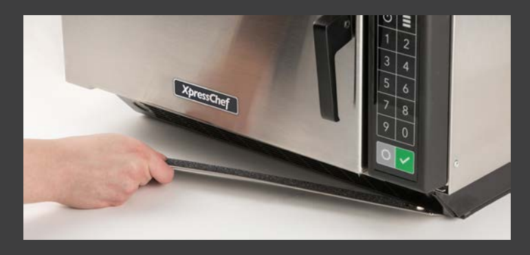
OPTIONAL MAGNETIC AIR FILTER ACCESSORY Removable/cleanable magnetic air filter. Enhances filtering of fine particulates that may be in the air with select installations/applications. (Accessory Item# AF10)